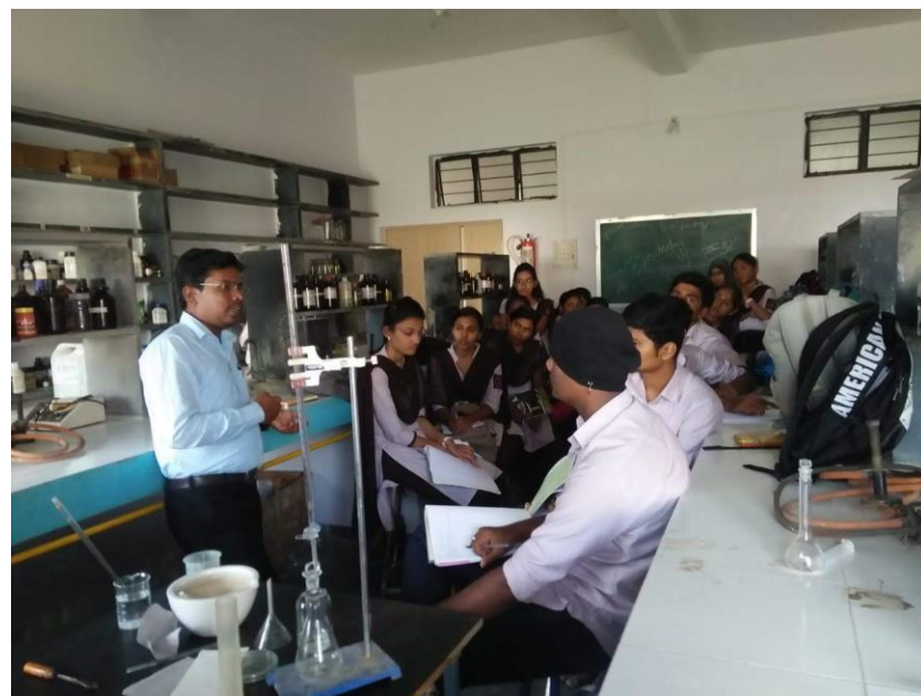
Laboratory induction for students of B.Sc. 1 Biotechnology