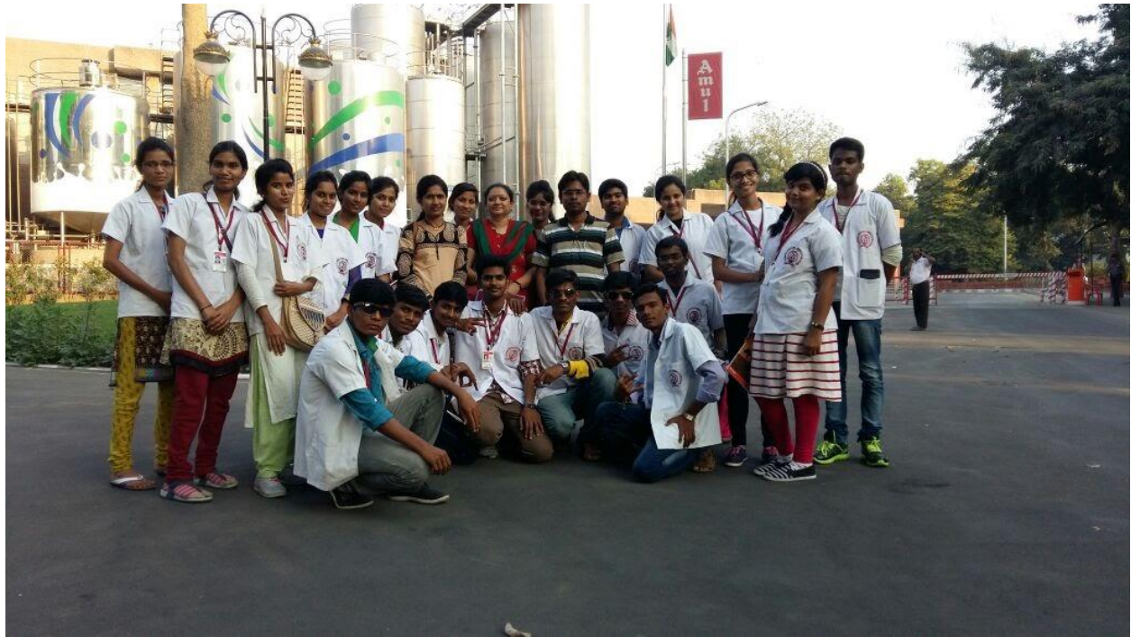
Students during industrial visit at Amul Industries, Gujarat.